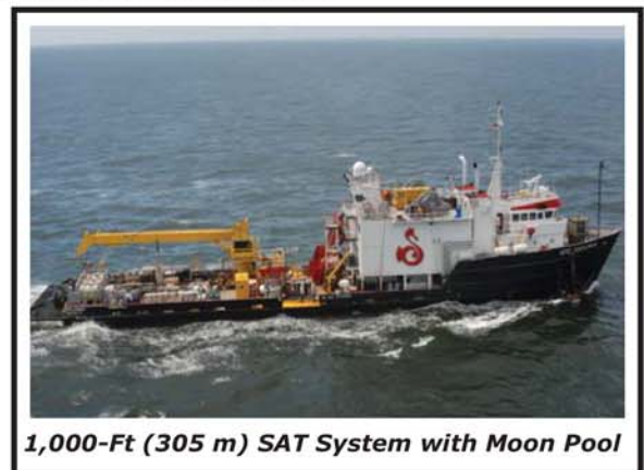
1,000-Ft (305 m) SAT System with Moon Pool