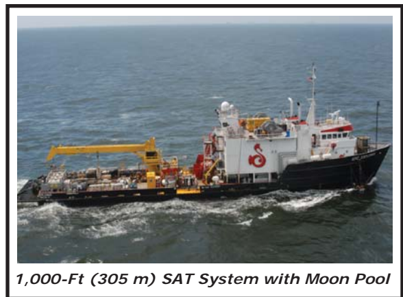
1,000-Ft (305 m) SAT System with Moon Pool